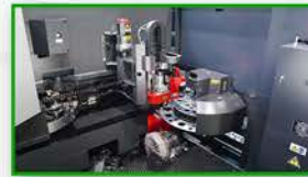
Amada EMZRB Turret Punch with automated loading /unloading tower 4000mm x 1500mm