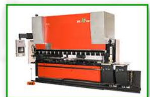
Amada HFE 170 tonne 3000mm