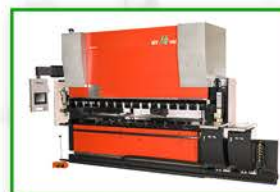
Amada HFE 170 tonne 4000mm