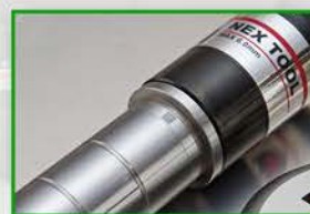
Amada Togu Tool Sharpener